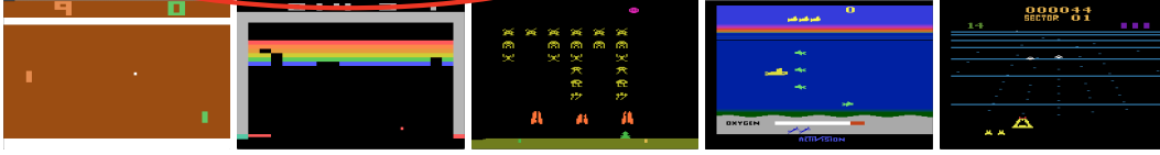
Figure 1: Screen shots from five Atari 2600 Games: (Left-to-right) Pong, Breakout, Space Invaders, Seaquest, Beam Rider

an experience replay mechanism [13] which randomly samples previous transitions, and thereby smooths the training distribution over many past behaviors.