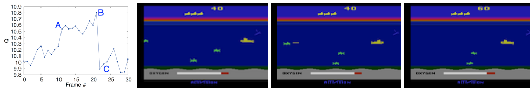
Figure 3: The leftmost plot shows the predicted value function for a 30 frame segment of the game Seaquest. The three screenshots correspond to the frames labeled by A, B, and C respectively.